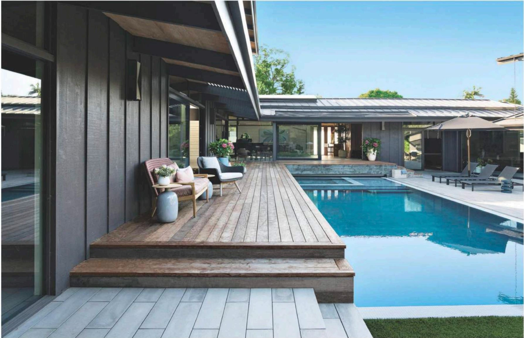
Outside, the designer created a seating area with a Gloster sofa and an armchair by Poltrona, upholstered with Delany & Long fabric from Cowtan & Tout. Across the pool by West Coast Pools are Eco Outdoor chaises and a Santa Barbara Designs umbrella. The plants and planters are from Rolling Greens Home + Garden.